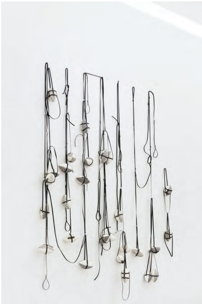
Li Jingxiong, Beast 54 , 2016 (installation view). Courtesy White Space, Beijing