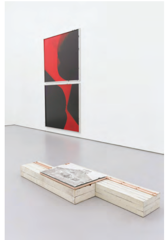
Li Jingxiong, Beast 54 , 2016 (installation view).

Li Jingxiong sets his course towards exploring a general social mechanism, or the lack of it, as an individual surviving and thinking in China's intense social reality. His works could be considered as a collection of ruins, raided by the uncontrollable power of the Leviathan, and washed up by a flux of social evolution. The social incidents that serve as milestones for this rupture are composed and proliferated via social networks, a continuous series of documentary fictions based on the truth, with an ambiguous, rapid and fleeting nature. Li's work is a form of documentary fiction that captures this changing terrain. Li employs various materials, from steel and copper to computer screens