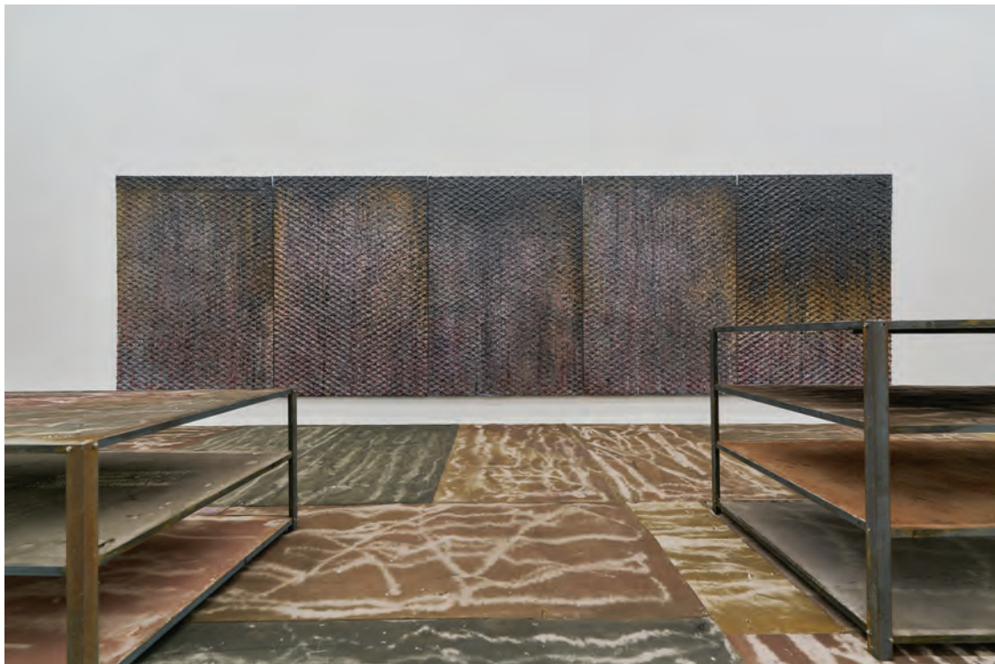
Li Jingxiong, The BAIYIN Project , 2016 (installation view, The New Normal: China, Art, and 2017, 2017 ).

The artist is in the business of creating new RUINS , works that subtly speak of the BRUTALITY and TRAGEDY of our social reality. Can sculpture be a sort of DOCUMENTARY FICTION ?